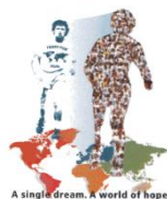
The Terry Fox Foundation